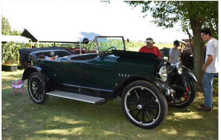
Carl & Moira Pfeiffer's 1917 Chevrolet