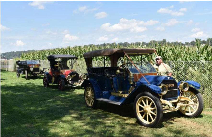
Achtel's 1911 Hudson, Hillbush's 1913 Buick 25 and Fitzhugh's 1913 T Ford Parked at Kinzer